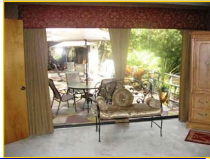
Master to Back Patio