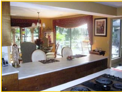
Kitchen & Breakfast Bar