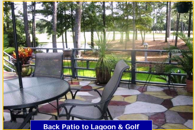
Back Patio to Lagoon & Golf

Purchase price includes Membership Initiation Fee.