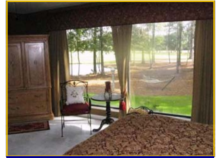
Master Bedroom View